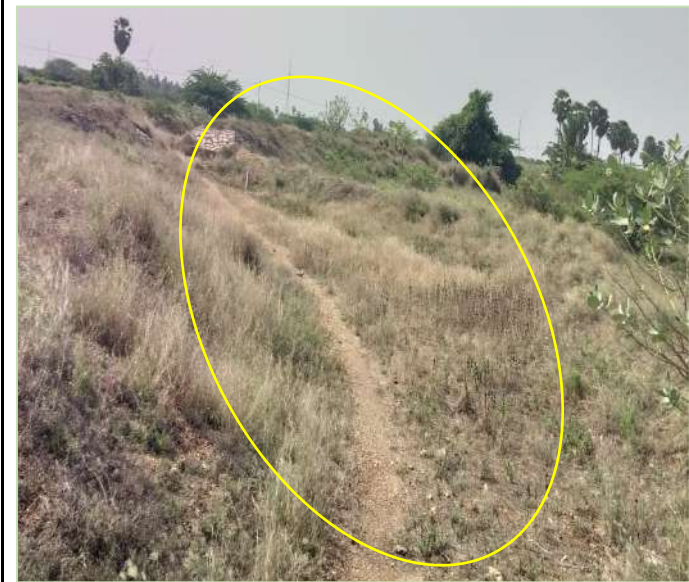
Excess soil to be cleared