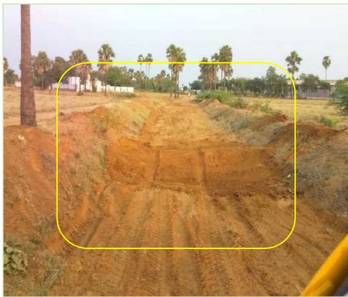
Excess soil cleared