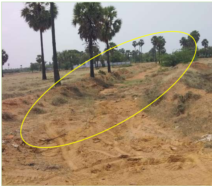
Excess soil to be cleared