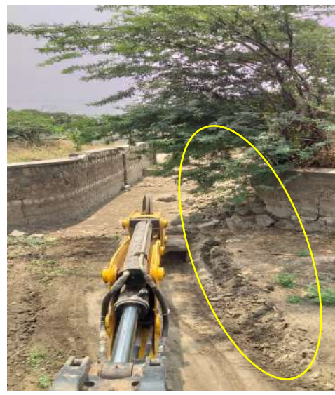
Excess soil to be cleared