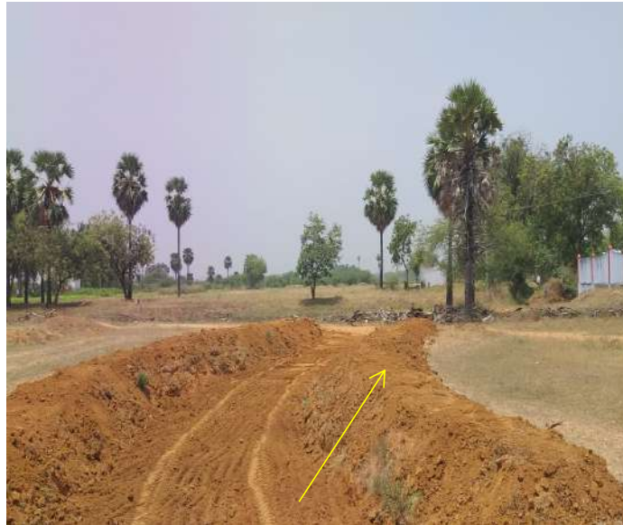
Excess soil cleared