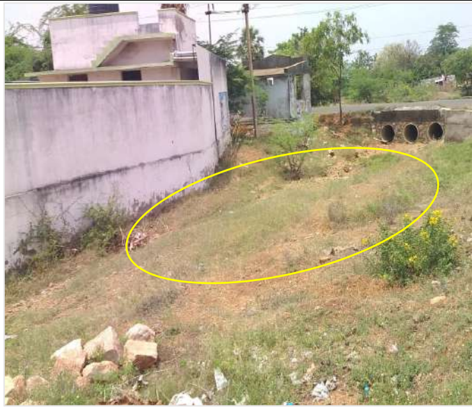
Excess soil to be cleared