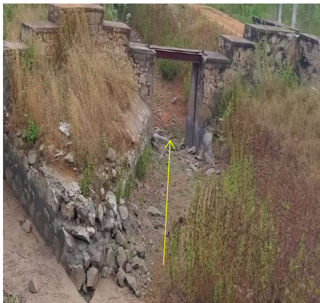
Excess soil to be cleared