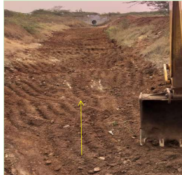
Excess clear and leveling done