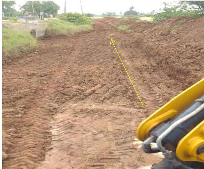
Excess soil cleared