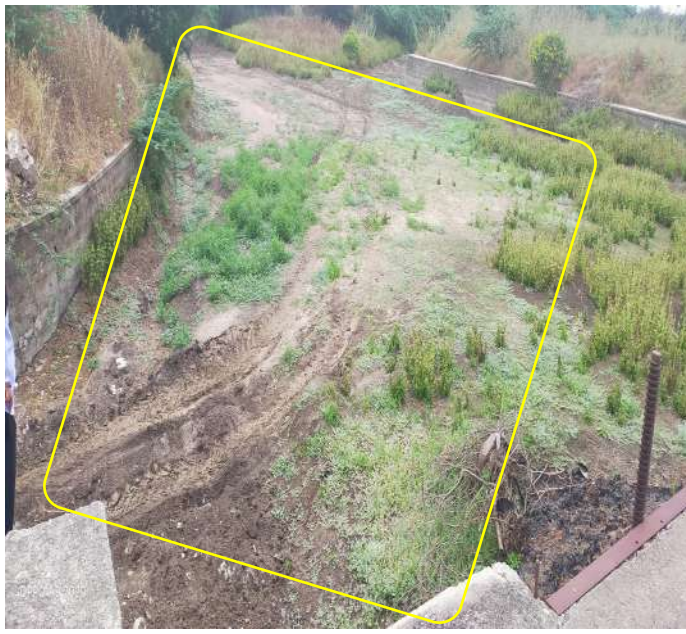
Grass bushes to be cleared