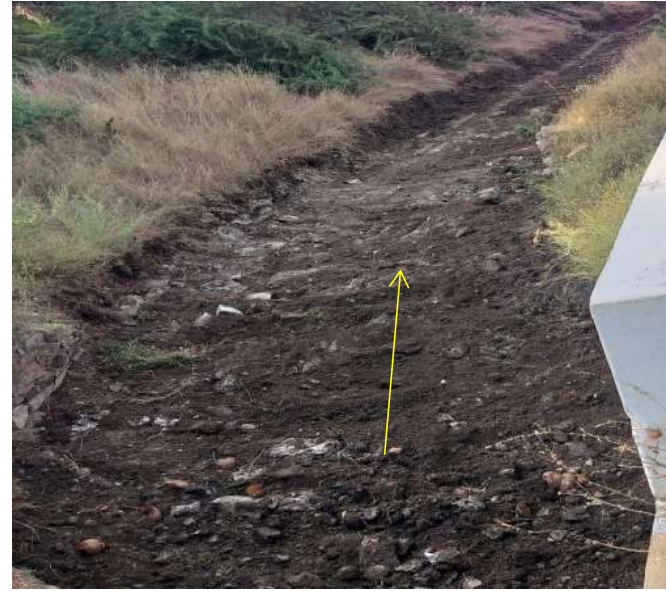
Excess soil removed