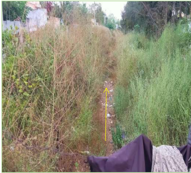
Clear the Grass bushes.