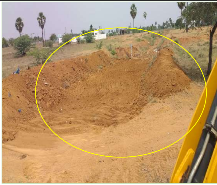
Excess soil cleared