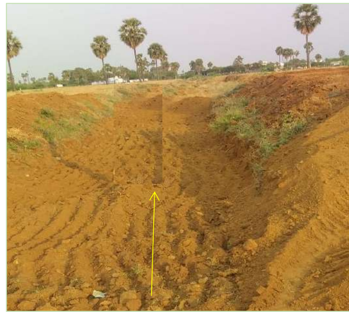
Excess soil cleared