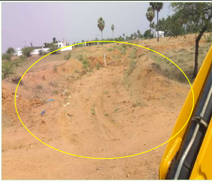
Excess soil to be cleared