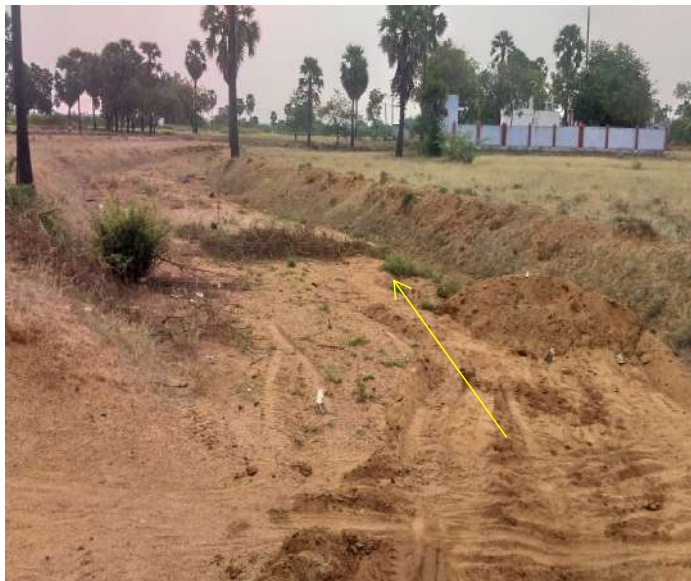
Excess soil to be cleared