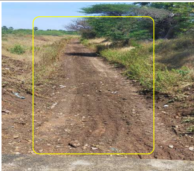
Excess soil & Grass bushes cleaned