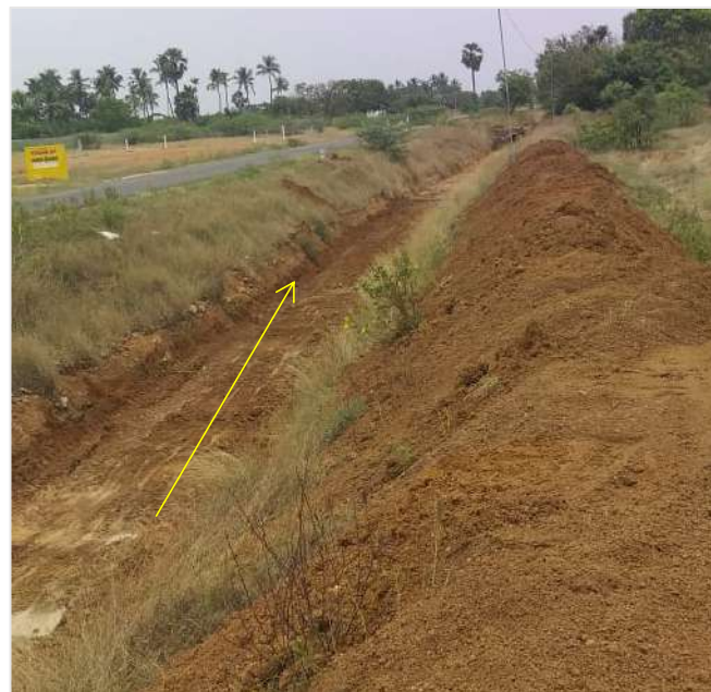
Excess soil cleared