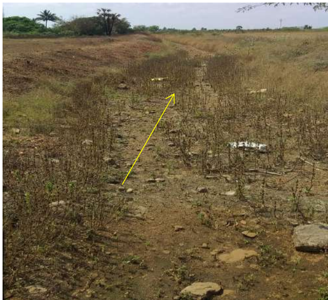
Grass bushes and excess soil to be cleared