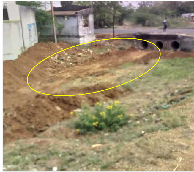
Excess soil cleared