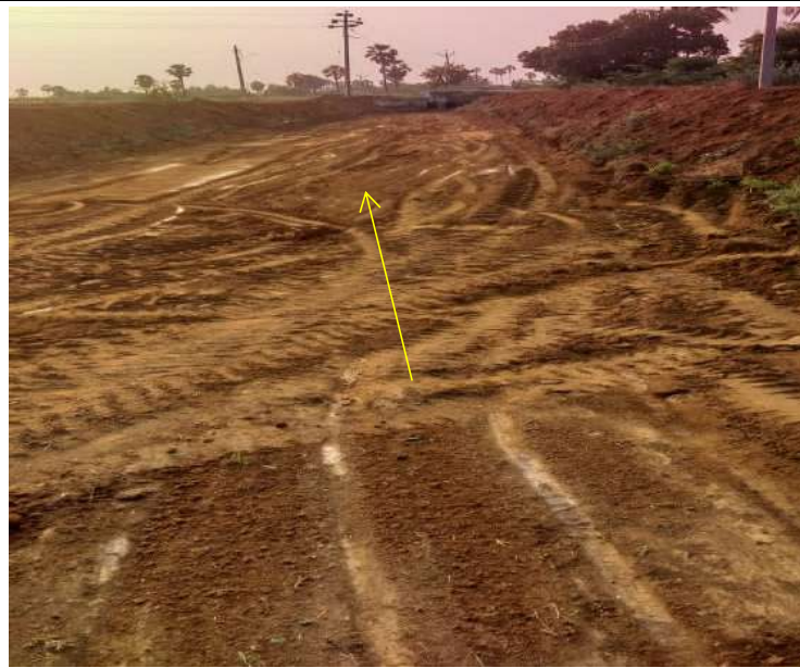
Excess soil cleared