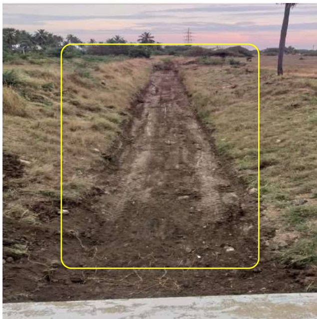
Grass bushes cleaned