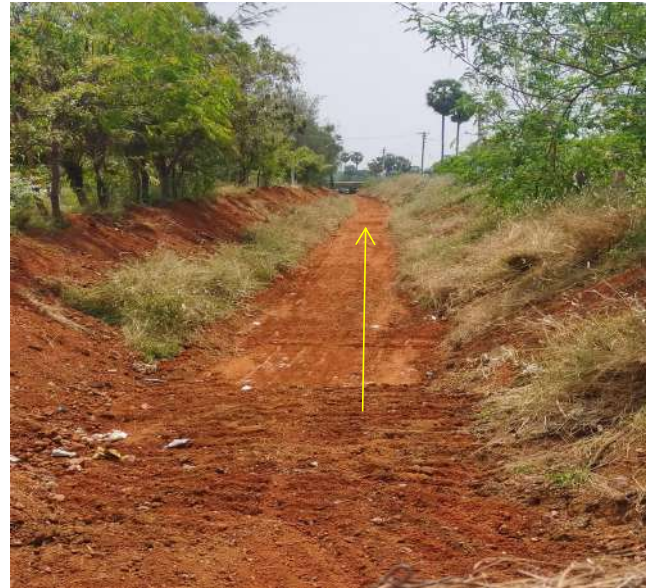
Grass bushes & excess soil cleared