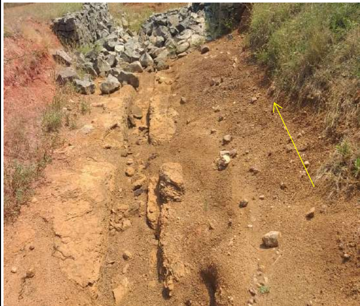
Excess soil to be cleared