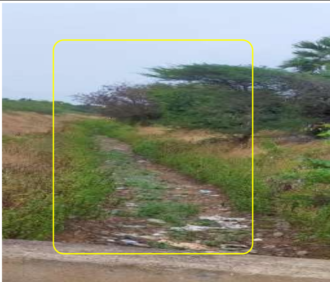
Excess Soil & Grass bushes to be cleared