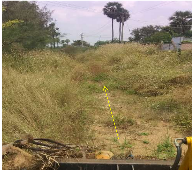
Clear the Grass bushes.