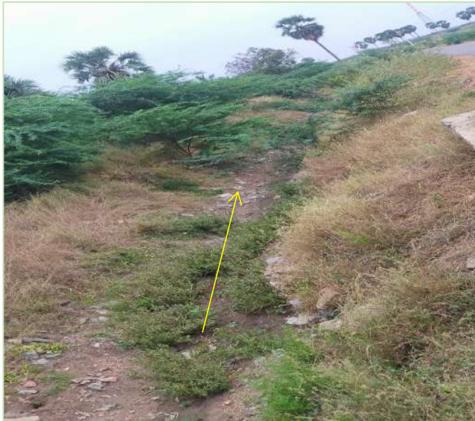
Excess soil to be cleaned