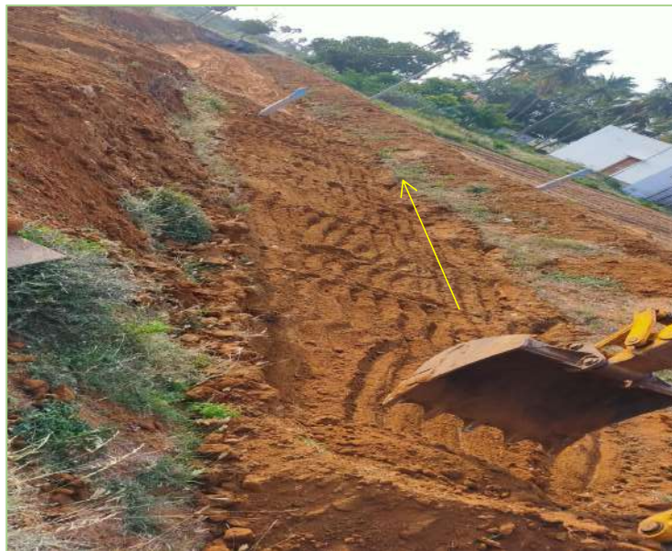
Excess soil cleared