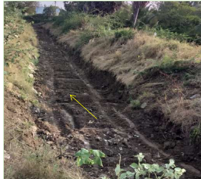
Excess soil removed