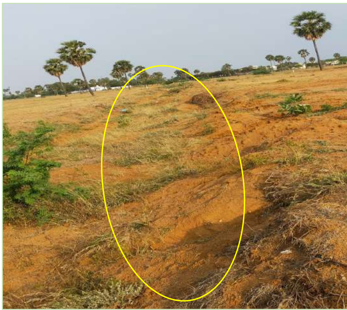
Excess soil to be cleared