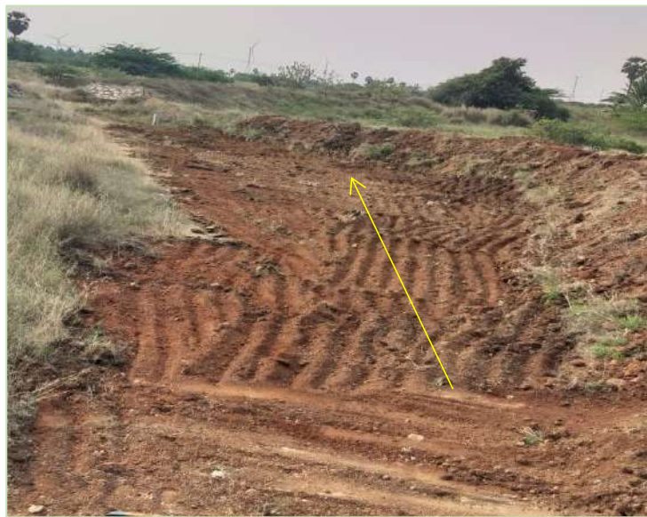
Excess soil cleared