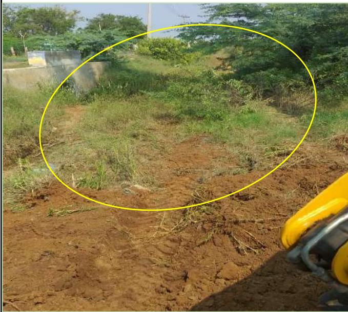
Excess soil to be cleared