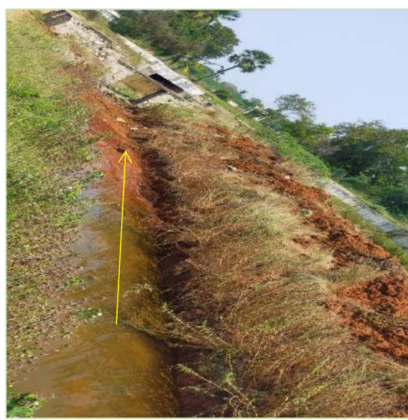
Grass bushes and excess soil cleared