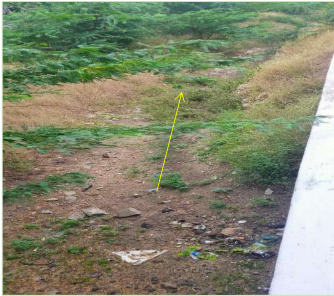
Excess soil to be cleaned