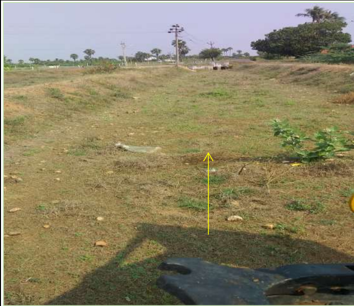
Excess soil to be cleared