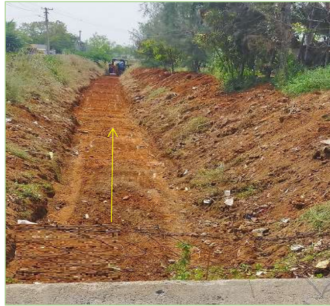
Grass bushes & excess soil cleared