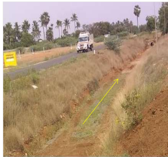
Excess soil to be cleared