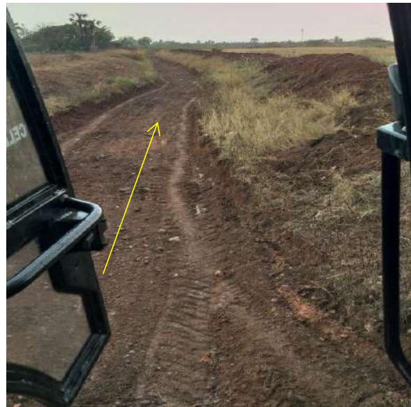
Grass bushes and excess soil cleared